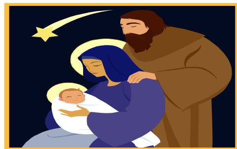
KEEP CHRIST IN CHRISTMAS